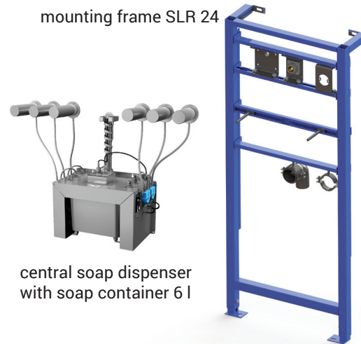
central soap dispenser with soap container 6 l