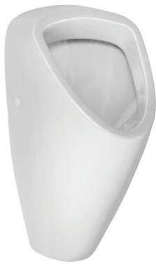
SLP 49 - CAPRINO PLUS