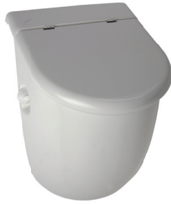
SLP 33 - CASA WITH A COVER