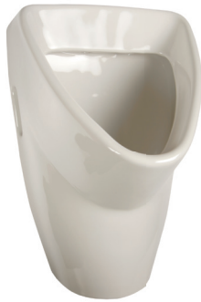
SLP 31 - LIVO