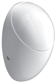
SLP 24 - ALESSI WITH A COVER