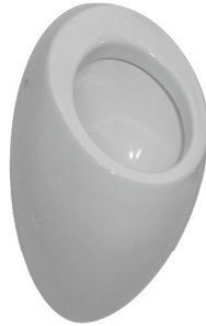
SLP 25 - ALESSI WITHOUT A COVER