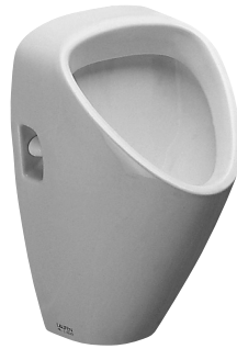
SLP 23 - CAPRINO