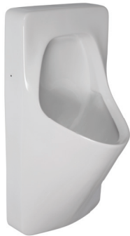
SLP 20 - ANTERO