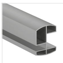
top profile (anodized aluminium)