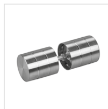
door handle for cubicle (stainless steel)