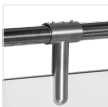
upper tubular profile, diameter 30 mm (stainless steel); for panel widths up to 60 cm, the upper profile does not need to be used