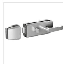
handle with cylinder lock (stainless steel)