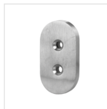
door stop (stainless steel)