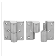
self-closing hinges (stainless steel)