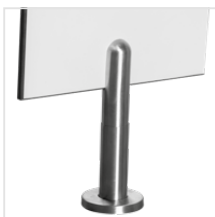
adjustable foot (stainless steel)