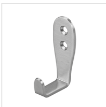
hook (stainless steel)