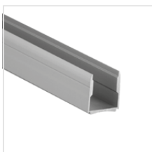
U profile for attaching panels to the wall (anodized aluminium)