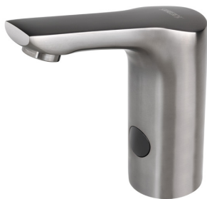
metal grey matt SLU 57HX