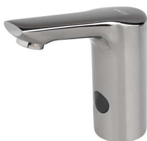
metal grey SLU 57H