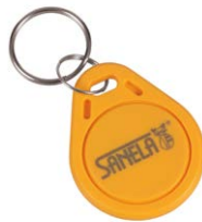
1 pc. from set of 50 pcs. tokens SLZA 51