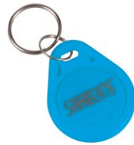
1 pc. from set of 50 pcs. tokens SLZA 51B