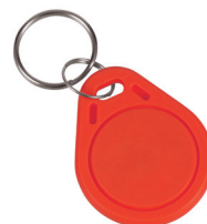
1 pc. from set of 50 pcs. tokens SLZA 51R