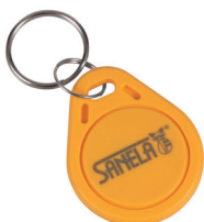
1 pc. from set of 50 pcs. tokens SLZA 51