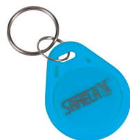
1 pc. from set of 50 pcs. tokens SLZA 51B