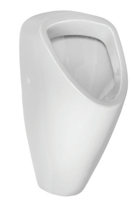
SLP 49 - CAPRINO PLUS