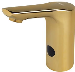
gold SLU 57G