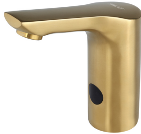
gold matt SLU 57GX