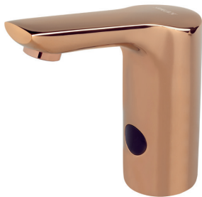
rose gold SLU 57F