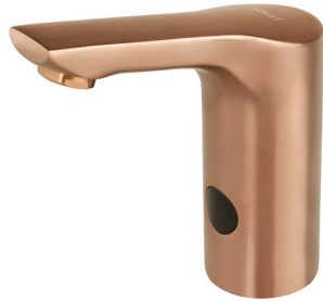
rose gold matt SLU 57FX