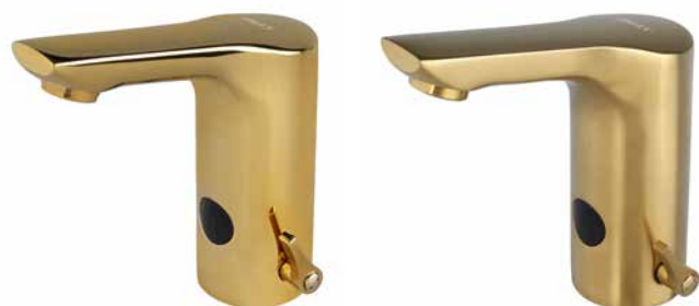
gold SLU 76NG