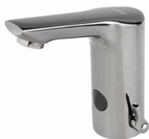
metal grey SLU 76NH