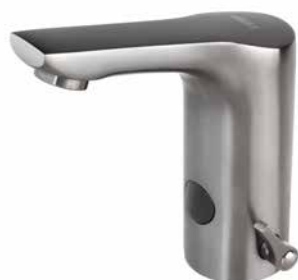
metal grey matt SLU 76NHX