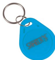
1 pc. from set of 50 pcs. tokens SLZA 51B