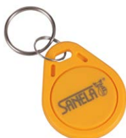
1 pc. from set of 50 pcs. tokens SLZA 51