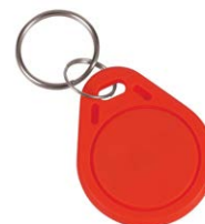
1 pc. from set of 50 pcs. tokens SLZA 51R