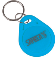
1 pc. from set of 50 pcs. tokens SLZA 51B