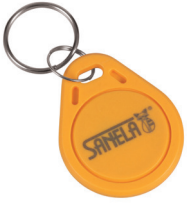
1 pc. from set of 50 pcs. tokens SLZA 51