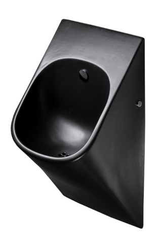
SLP 89S - LA FONTANA