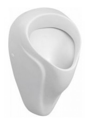
SLP 18 - NOVA PRO ALEX