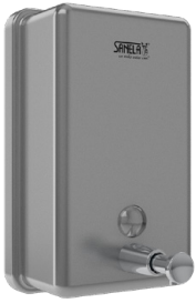
SLZN 39X 95392 Stainless steel liquid soap dispenser