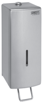
SLZN 73 85730 Stainless steel liquid soap dispenser