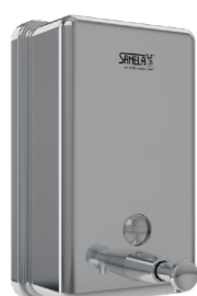
SLZN 39A 95391 Stainless steel liquid soap dispenser