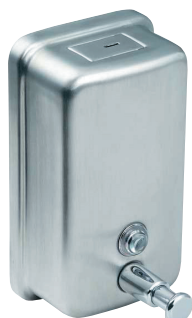
SLZN 05 95050 Stainless steel liquid soap dispenser