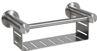
SLZN 76 85760 Stainless steel shampoo holder