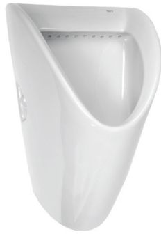
SLP 27 - Roca - Chic