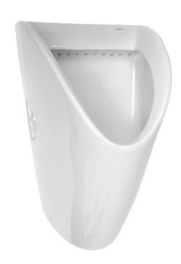
SLP 27 - Roca - Chic